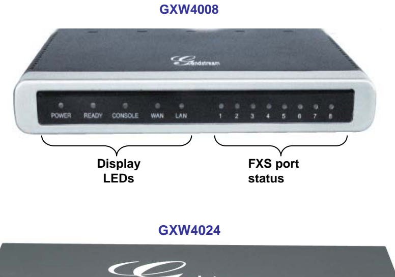
Display LEDs FANOSTREAM FORER READY LAN FILEPHONE PORTS GRANDSTREAM GXW4024